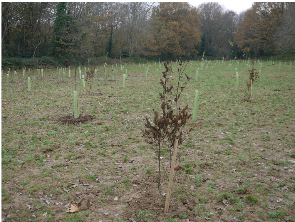
Some of the planted trees