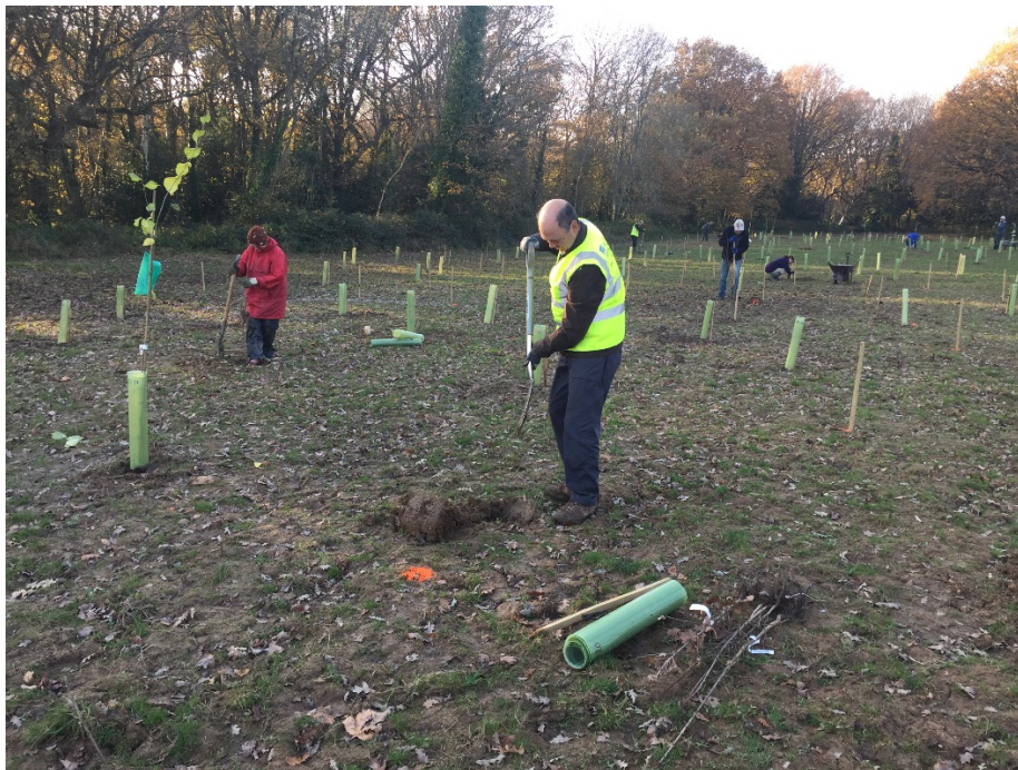
Socially distanced planting