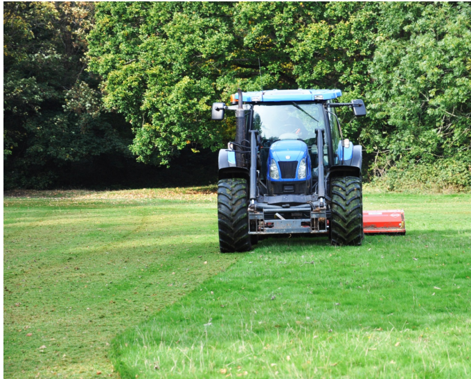
Flail mowing. This destroys the grass

October 22 nd : Preparation of the ground and the sowing of the wildflower seeds.