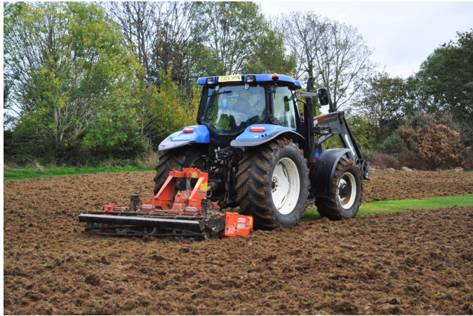
Power harrowing this breaks up the soil