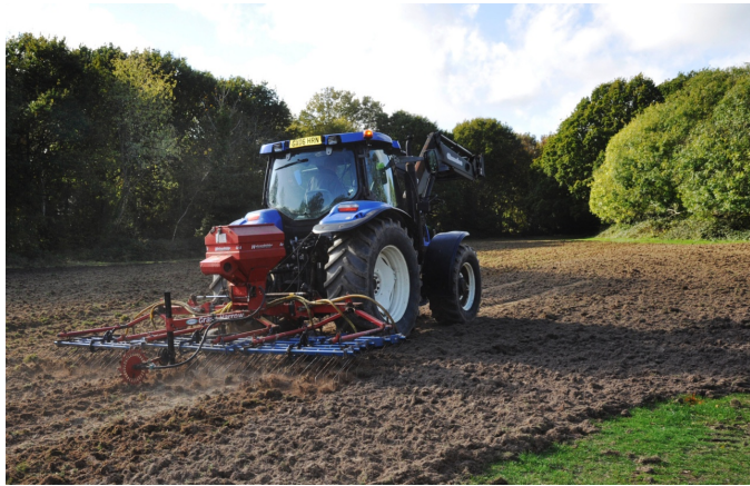
Sowing the wildflower seed and covering it using a harrow