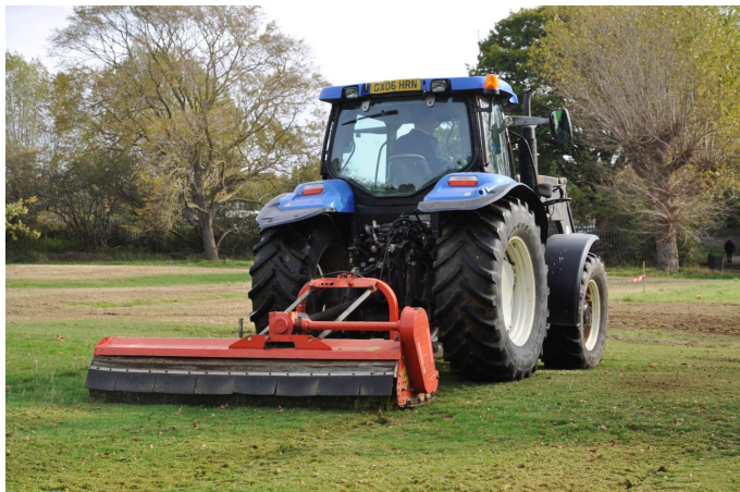
Flail mowing, this destroys the grass