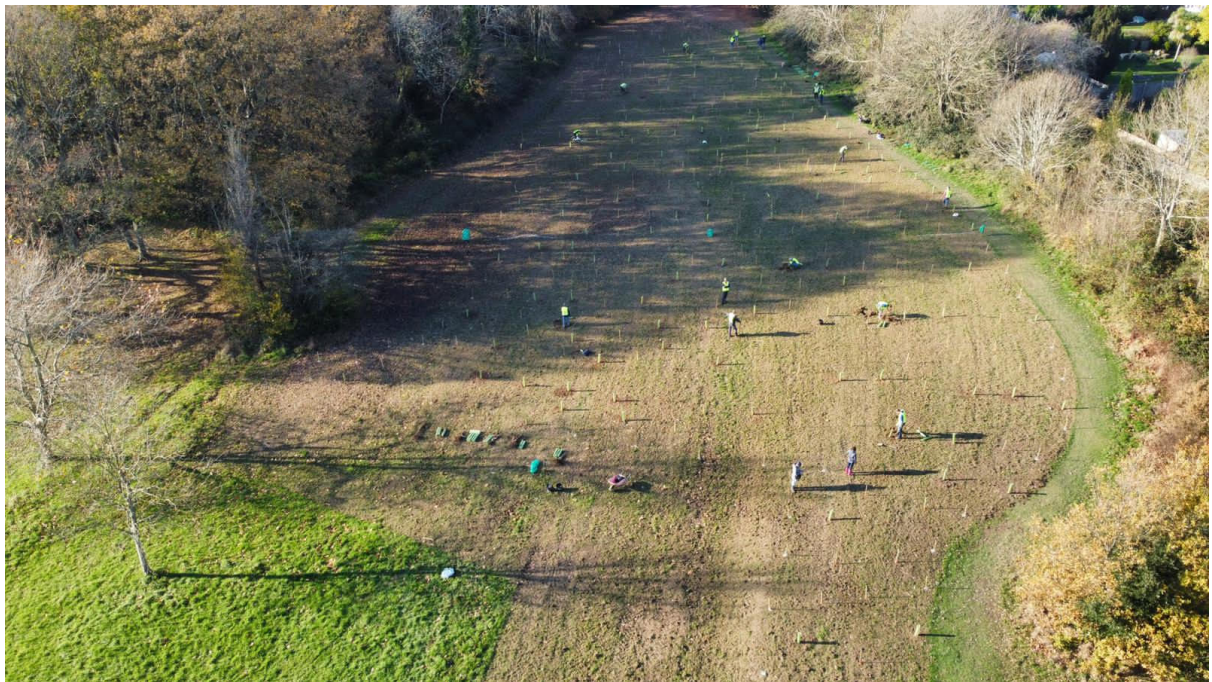
From the air.