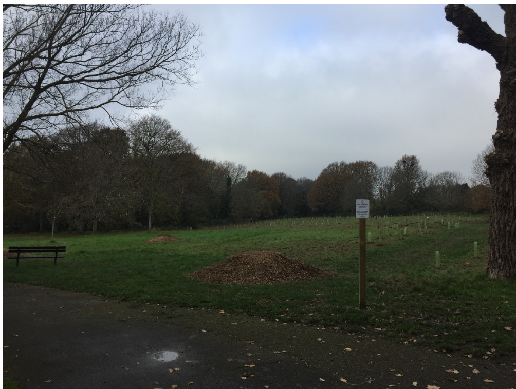
The finished area.