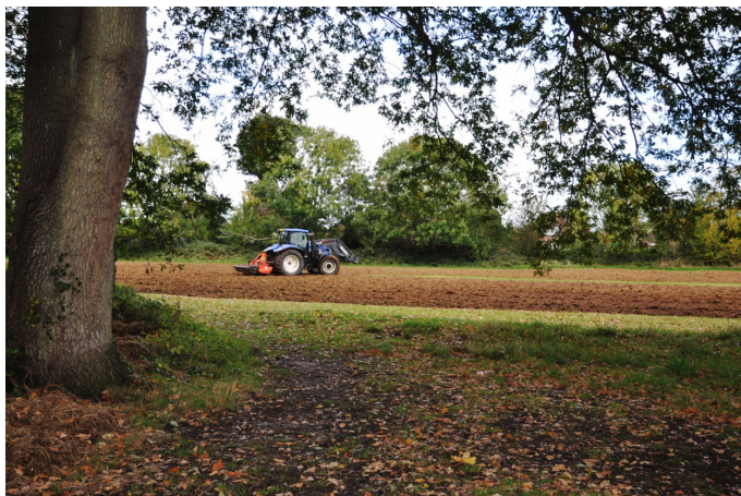
Power harrowing, this breaks up the soil