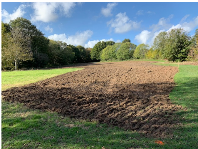
The finished area.